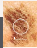
Diameter 1/4 inch or 6mm